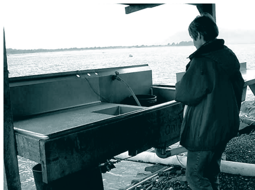
Fish Cleaning Station

as bait). Some fish processing plants will accept fish wastes.