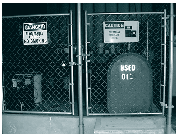
Proper Storage of Used Oil