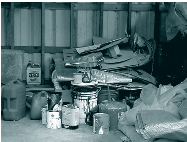
Hazardous Waste (poor storage practice)

materials, including used batteries, should prevent releases to the environment and inadvertent public contact. Use practices that prevent overfilling, tipping, or rupture. Observe the following practices: