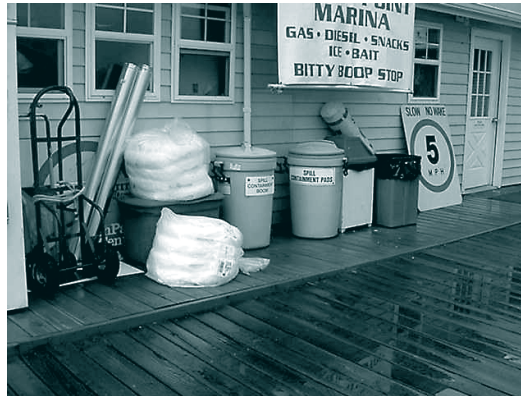
Spill Cleanup Materials

These activities should be conducted with the vessel out of the water (and within an area designed for that purpose, if likelihood exists that pollutants may be lost to water):