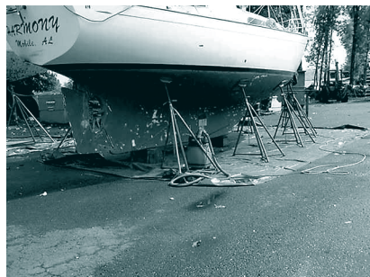
Vessel Bottom Work.

reduces environmental impact from metals, pesticides and other contaminants associated with paints and paint removal. Particles from sandblasting (paint chips and sand), oil, and sediment are removed from vessel surfaces during scraping and sanding. Sandblasting and paint removal should only be conducted in designated areas that have been labeled as repair areas and designed